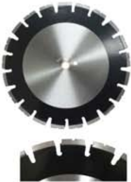
Carbide Tip Insert and Drop Seg. for adding undercut protection

For Asphalt and Asphalt Over Concrete Roadways Use Up To 65 HP Walk Behind Saws - Supreme Pro