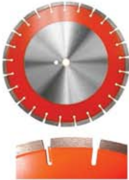
with Carbide Tip Insert for adding undercut protection

For Concrete, Concrete Roadways and Hard Concrete Use Up To 65HP Walk Behind Saws